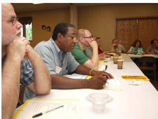
Pastors attending the orientation for newly appointed pastors